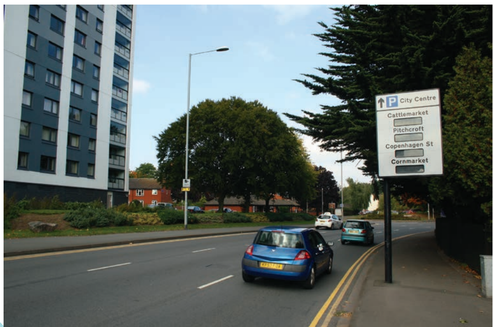
Variable message sign on Tybridge Street

Each sign displays current information on the four car parks nearest to it. Worcestershire County Council has completed a project to update information signs across the city, providing accurate car park location information.