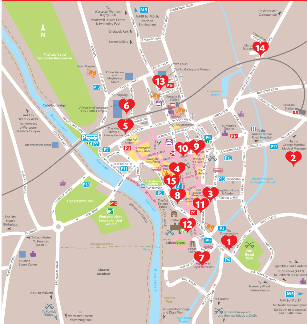
Map is for illustrative purposes and is not to scale